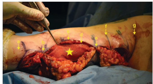
Fig. 1. Intraoperative view demonstrates the position of the single layer of SERI that was placed in the excisional wound before closure of the SFS. Star indicates SERI Surgical Scaffold; a, antecubital fossa of the arm; b, temporary tacking staple; c, skin edge and subcutaneous tissue; d, layer of the SFS; e, temporary tacking staple; f, closure alignment markings; g, axilla.

A lipoplasty support garment was placed immediately after surgery and was worn by the patient until she was comfortable without it (~5 weeks). She received monthly follow-up and returned to her work as a massage therapist just 1 month postoperatively.